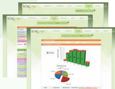
trixbox Pro Control Panel

Get a trixbox Pro phone system preinstalled and fully tested with the box that it was built to run on. trixbox Appliance is the only complete solution designed for trixbox by trixbox. The hand-selected hardware gives you the highest quality phone calls with VoIP, digital, and analog connectivity options.