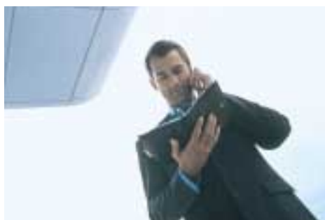
KX-TCA255 Compact Business Model